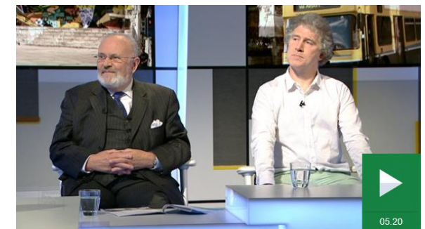
Plans to take cars out of Dublin city centre